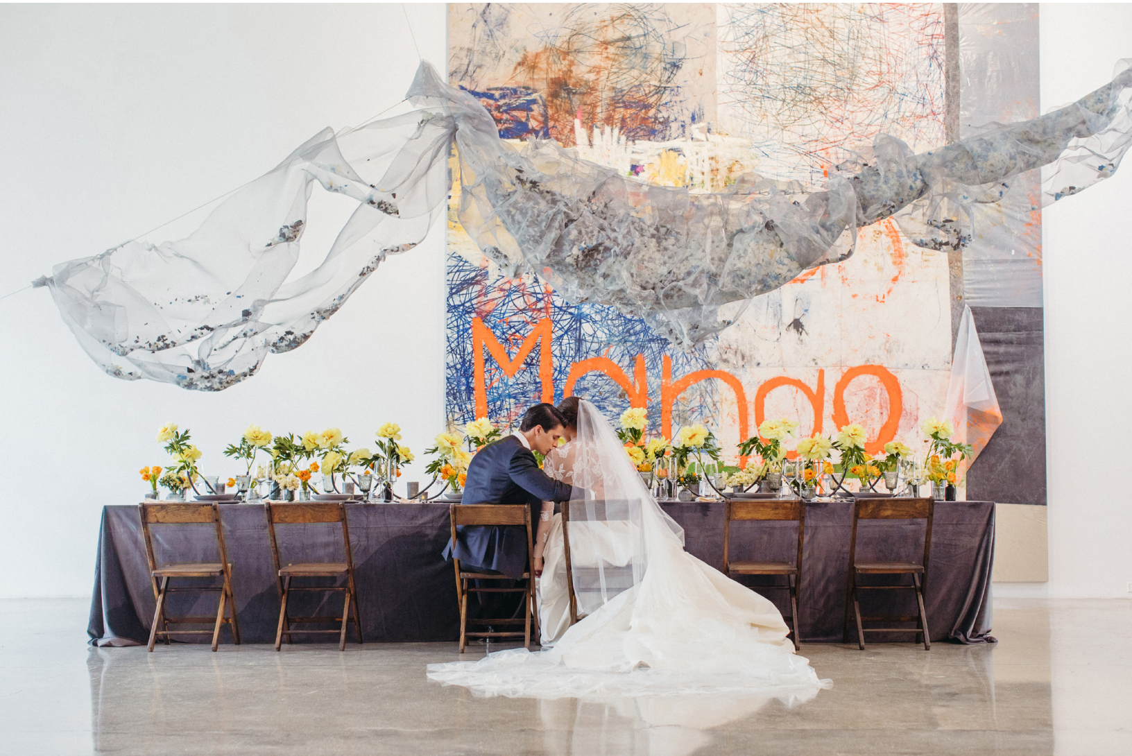
Artwork in photo by Oscar Murillo

The Rubell Museum first opened December 4th, 2019 and houses one of the most significant and far-ranging private collections of contemporary art in the world. The collection is distinguished by the diversity and geographic distribution of artists represented within it, and the depth of its holdings of seminal artists. Housed in a former industrial building transformed by Selldorf Architects , the new museum features 53,000-square-feet of galleries situated on a 100,000 square foot campus. Christian Dior Homme made fashion history unveiling its first men's fashion show in the USA at the Rubell Museum grand opening during Art Basel 2019.