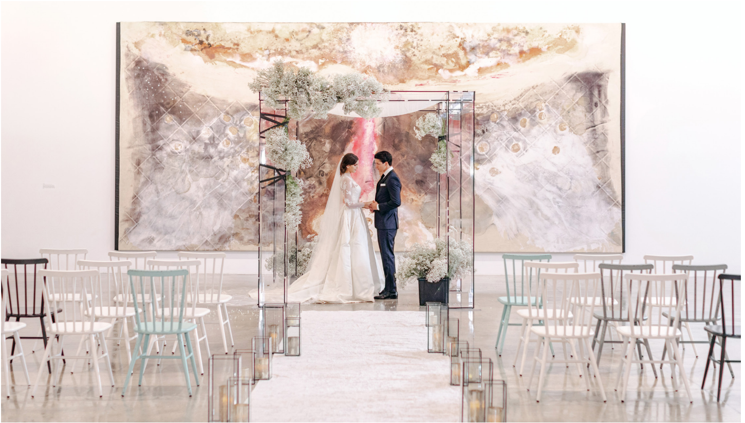
Artwork in photo by Lucy Dodd